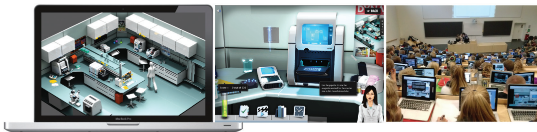
Figure 1 Screenshots from the gamified laboratory simulation tested in this study (Labster, http://www.labster.com/biolabs/ ) (left, center). Students used the simulations from regular computers at home (in the case of testing at Stanford University Online High School) or in class (right).

We also conducted a study on 57 students from four Danish high schools. Forty-four percent of the students agreed or completely agreed with the statement, “I consider pursuing an education within biotechnology or other biological subject to a greater extent, after having used the gamified laboratory simulator.” This indicates that gamified laboratory simulations may provide a powerful case for initiatives to increase students' engagement and motivation for further studies and careers within biotech. Large-scale longitudinal studies measuring the actual study and career choices of students exposed to gamified laboratory simulations compared with a control group would be valuable to guide future decisions.